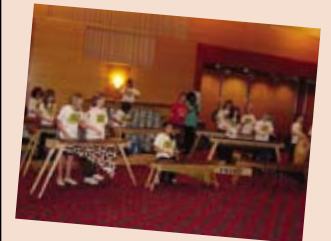
Marimba at Bicycle Transportation Alliance Event at Oregon Convention Center